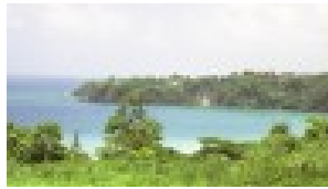
Away from the hustle of the City.

The 2007 Writer's Retreat is five intense, inspiring days of learning and creativity. You will learn the art of story telling, character development and how to build a powerful plot for either your novel, stage or screenplay.